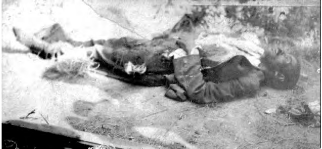
While the white riot dead appear to have all been given proper burials, little effort was made by the white authorities to identify the bodies of black riot victims. Indeed, as both long-forgotten funeral home records and death certificates would confirm, some unidentified African-American riot victims were hurriedly buried in unmarked graves at Oaklawn Cemetery.