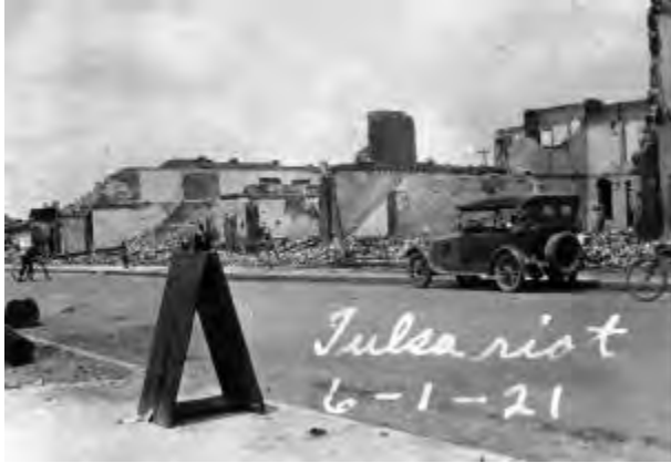
Despite the aid given by the Red Cross, black Tulsans faced a gargantuan task in the rebuilding of Greenwood. Literally thousands were forced to spend the winter of 1921-22 living in tents.

but not really very significant, event in the state's past. Oklahoma history textbooks published during the 1920s did not mention the riot at all — nor did ones published in the 1930s. Finally, in 1941, the riot was mentioned in the Oklahoma volume in the influential American Guide Series — but only in one brief paragraph. 8