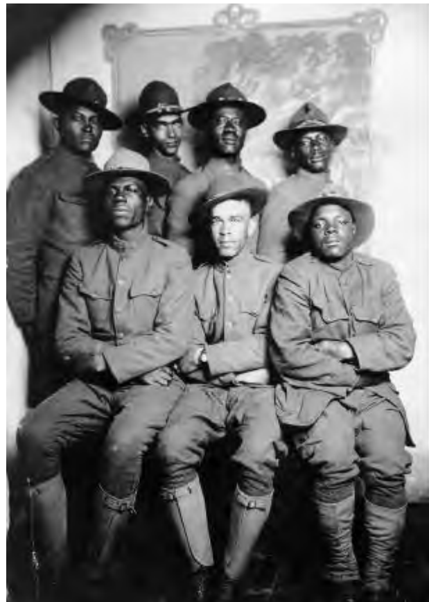
African Americans rallied solidly behind the nation's war effort during World War I, and thousands of black soldiers served in France. Upon their return to the U. S., however, many black vets found that the democracy that they had fought to protect overseas was often unavailable to them back home.