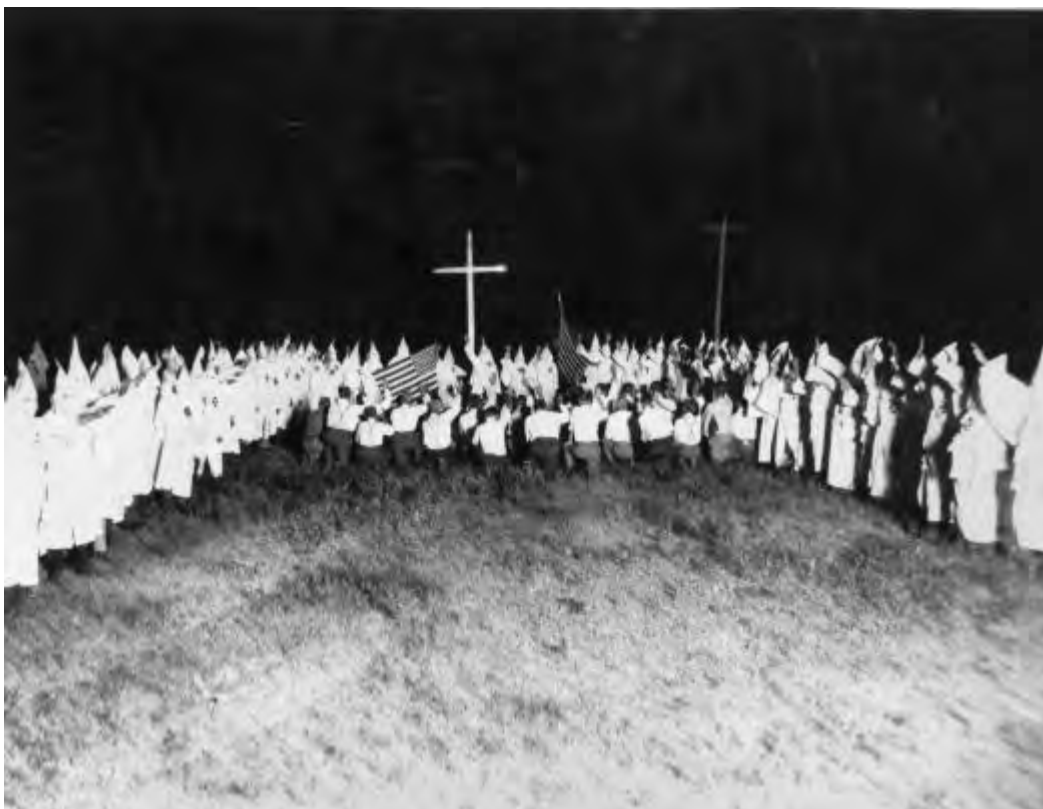
The Ku Klux Klan gripped Oklahoma in the 1920s, this ceremony was in Lone Grove.

infamous “Grandfather Clause”, which effectively ended voting by African Americans statewide. While the law was ruled unconstitutional by a unanimous vote by the U.S. Supreme Court four years later, other methods were soon employed to keep black Oklahomans from the polls. Nor did the Jim Crow legislation stop there. In the end, the state legislature passed a number of segregation statutes, including one which made Oklahoma the first state in the Union to segregate its telephone booths. 29