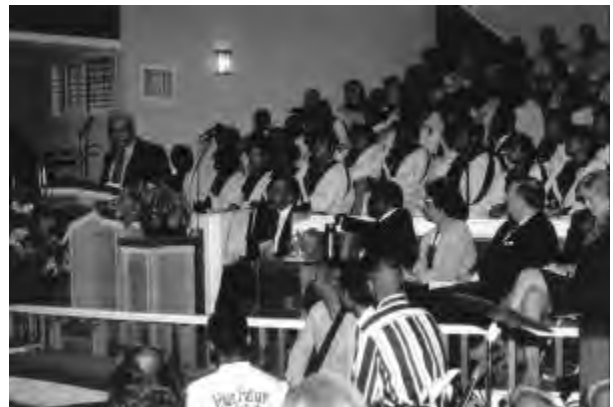
Commemoration of the riot conducted by Ben Hooks.

A few other court cases, largely involving claims against the city and various insurance companies, lingered on for a number of years afterward. In the end, while a handful of African Americans were charged with riot-related offenses, no white Tulsan was ever sent to prison for the murders and burnings of May 31, and June 1, 1921. In the 1920s Oklahoma courtrooms and halls of government, there would be no day of reckoning for either the perpetrators or the victims of the Tulsa race riot. Now, some seventy-nine years later, the aged riot survivors can only wonder if, indeed, that day will ever come.