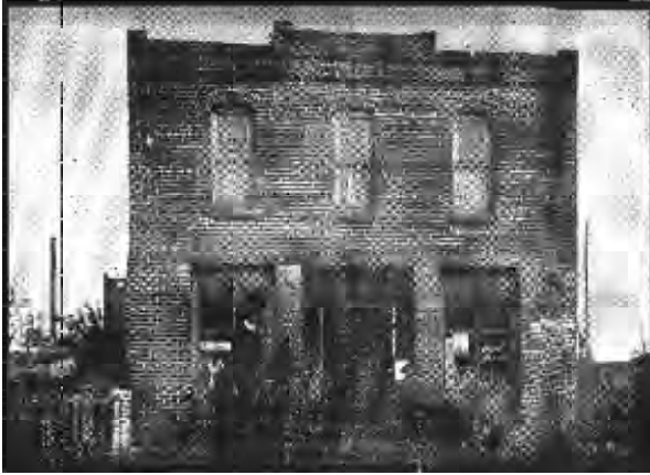
The Gurley Building prior to the riot.