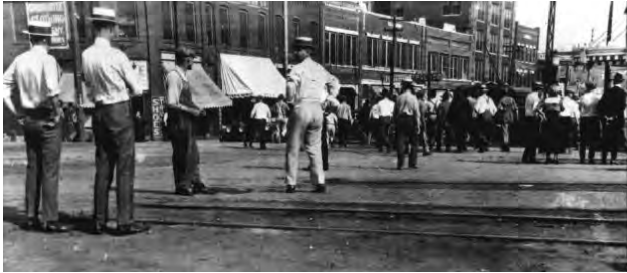
Following the outbreak of violence at the courthouse, crowds of angry whites took to the streets downtown. There, according to white eye witnesses, a number of blacks were killed in the riots early hours. And even though the fighting soon moved north to ward Greenwood, groups of whites—including these at Main and Archer—were still roaming the streets of downtown the next morning.

and into the more familiar environs of the African American community. 110