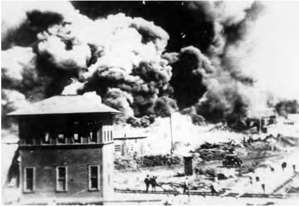
White rioters began setting black homes and businesses on fire around mid night, largely along Archer Street. There were atrocities as well. One elderly African-American couple, it was later reported, was shot in the back of the head by whites as they knelt in prayer inside their home.