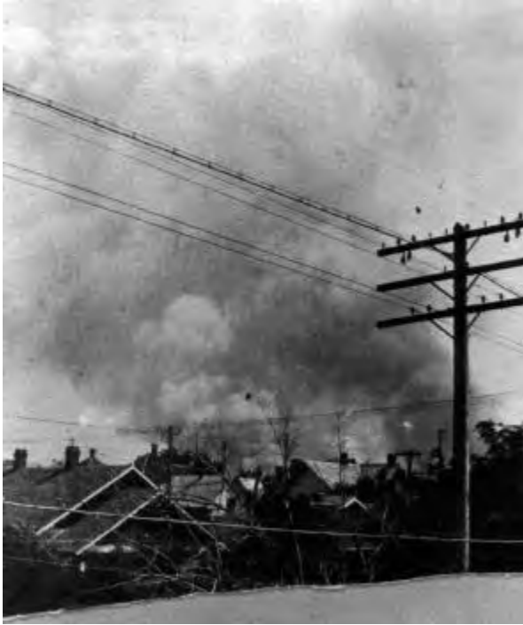
Sweeping past the black business district, now aflame, the white rioters entered the heart of Tulsa's African-American residential area (Courtesy Oklahoma Historical Society).

looking the Eleventh Street bridge. Some local guardsmen also were deployed to stand guard at various public works as well including the city water works along the Sand Springs road, and the Public Service Company's power plant off First Street. 137