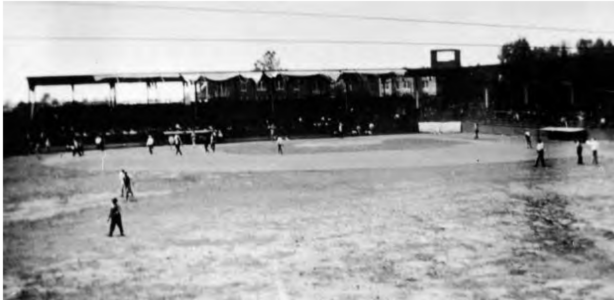
As more and more African Americans were detained the “protective custody” alternate holding locations had to be used including McNulty baseball Park.

approximately 109 soldiers and officers under his command, pulled into Tulsa’s bullet-scarred Frisco and Santa Fe passenger depot at approximately 9:15 a.m. on the morning of June 1, 1921. The soldiers, who arrived armed and in uniform, were all-members of an Oklahoma City based National Guard unit. In Tulsa, they soon became known, by both blacks and whites, as the “State Troops,” a term which had the intrinsic benefit of helping to distinguish the out-of-towners from the local National Guard units. Like the local guardsmen, the State Troops were also all-white. 183