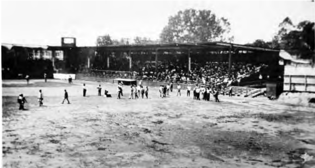
On the morning of June 1, most black Tulsans who were taken into custody were brought to Convention Hall, on Brady Street. But as the day wore on, and more and more African Americans were placed under arrest, new internment centers had to be established.

custody. While the white authorities would later argue, and not without some validity, that this was a protective measure designed to save black lives, other reasons including a lingering white fear of a “Negro uprising” undoubtedly played a role in their rationale. In any event, following the destruction of their homes and businesses on May 31 and June 1, black Tulsa now found itself, for all practical purposes, under arrest. 195