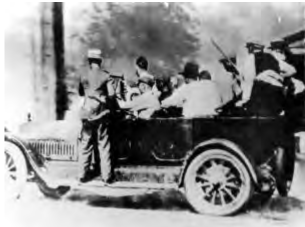
During the nighttime hours of May 31 and June 1, groups of armed whites made “drive-by” shootings in black residential neighborhoods, firing into African-American homes.

The nighttime hours of May 31, and June 1, also witnessed the first organized action taken by the Tulsa units of the National Guard. While evidence indicates that Sheriff McCullough may have requested local guard officers that they send men down to the courthouse at around 9:30 p.m., 122 it was not until more than an hour later — about the time that the fighting broke out at the courthouse — that the local National Guard units were specifically ordered to take action with regards to the riot. According to the after action report later submitted by Major James Bell to local National Guard commander Lieutenant Colonel L.J.F. Rooney: