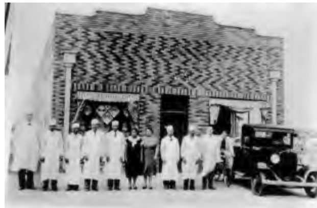
One of the Mann Grocery stores of the Greenwood district.

Most of the black-owned businesses in Tulsa were, of course, much more modest affairs.