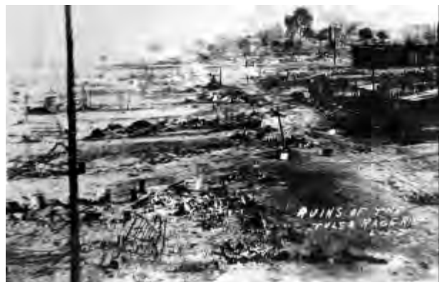
As black Tulsans won their release from the various internment centers, and returned to Greenwood, most discovered that they no longer had homes anymore.

Gone, too, were hundreds of homes, and more than a half-dozen African American churches, all torched by the white invaders. Nearly