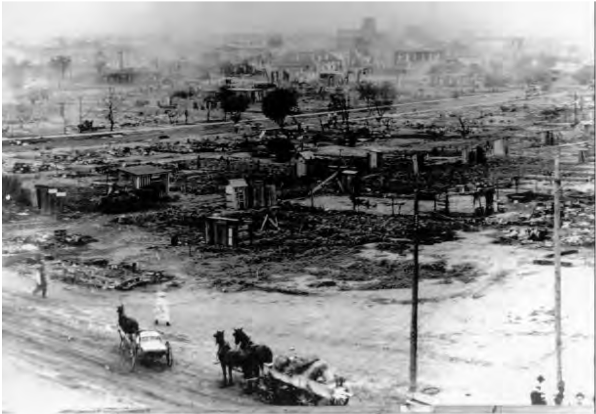
Aftermath of the riot.

These things are not myths, not rumors, not speculations, not questioned. They are the historical record.