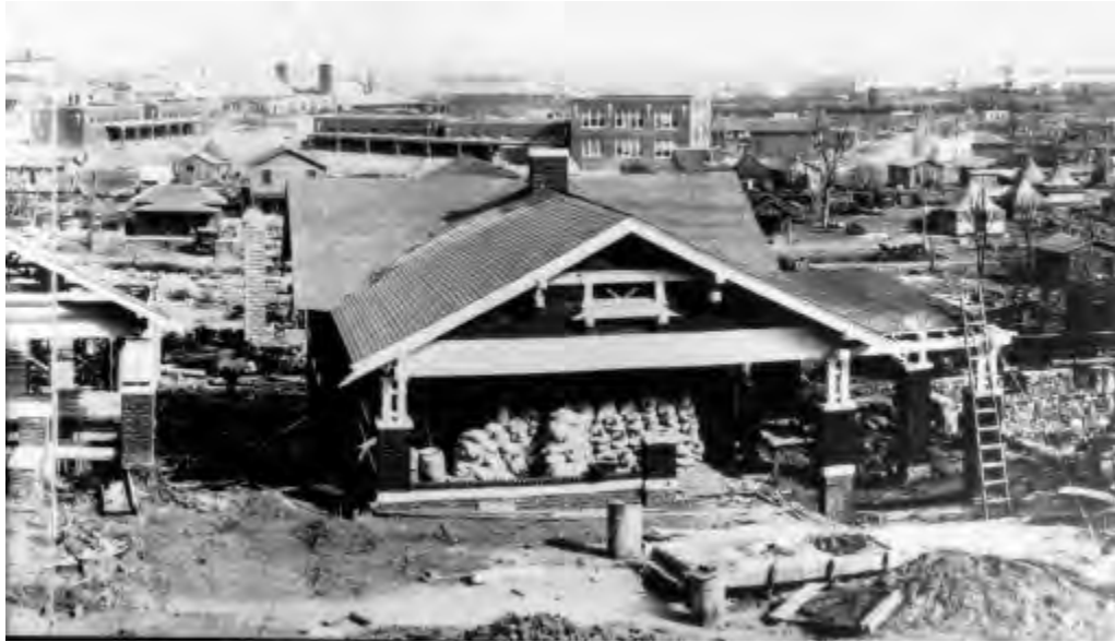
Rebuilding after the destruction (Courtesy Greenwood Cultural Center).

building; in fact, municipal authorities acted initially to impede rebuilding.