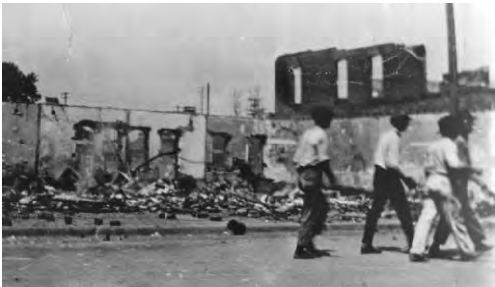
Curiosity reigned as whites toured the destroyed Greenwood district after the riot.