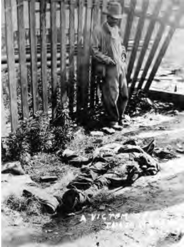
From the first shots that were fired at the courthouse on May 31, to the last fighting that took place on June 1, the Tulsa race riot proved to be a particularly lethal affair. And while a definitive death count is still elusive, it is clear that dozens of blacks and whites lost their lives in the catastrophe.