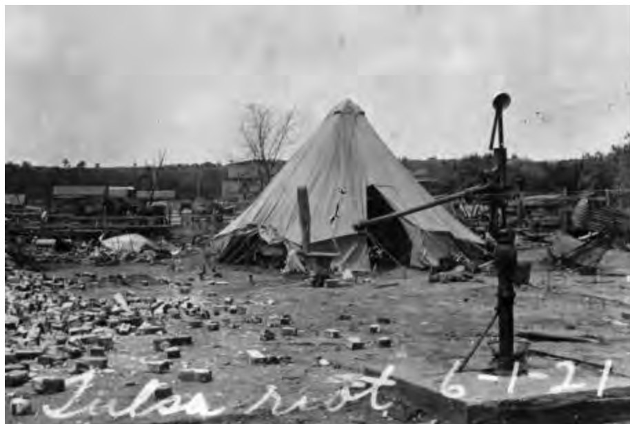
Many African Americans were forced to spend the winter after the riot in tents (Courtesy Oklahoma Historical Society).

However, for black Tulsans, the trials and tribulations had only just begun. Six days after the riot, on June 7, the Tulsa City Commission passed a fire ordinance designed to prevent the rebuilding of the African American commercial district where it had formerly stood, while the so-called Reconstruction Commission, an organization of white business and political leaders, had been fuming away offers of outside aid. In the end, black Tulsans did rebuild their community, and the fire ordinance was declared unconstitutional by the Oklahoma Supreme Court. Yet, the damage had been done, and the tone of the official local response to the disaster had already been set. Despite the Herculean efforts of the American Red Cross, thousands of black Tulsans were forced to spend the winter of