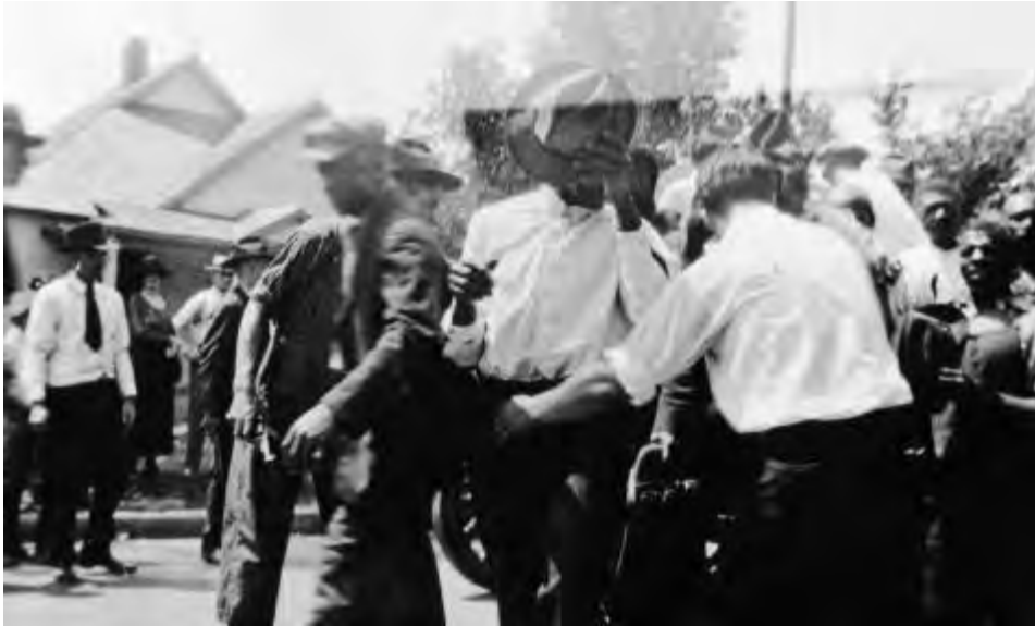
African Americans were detained by many different whites, not only the police or National Guard.

rioters. Ray's inconsistency in applying precedent suggests that his motive was not a solely impartial decision of the case before him, but the insulation of the police department and Tulsa from liability.