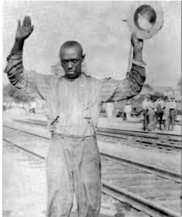
While the white rioters continued their assault upon the African-American community, black Tulsans soon found themselves subject to arrest by Tulsa officials and "special deputies".