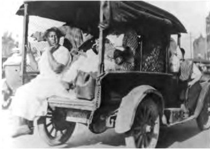
Shock and despair accompany the aftermath of the Tulsa Race Riot.