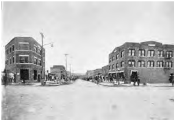
Greenwood District prior to the riot (Courtesy Greenwood Cultural Center).