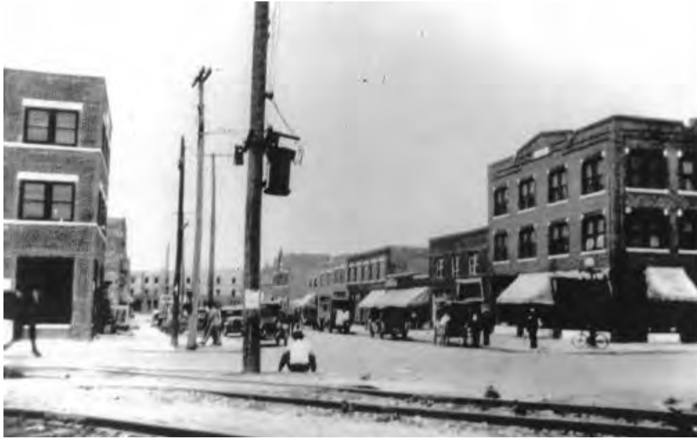
Centered along busy Greenwood Avenue, Tulsa's African-American commercial district was a bona fide American success story. Home to literally dozens of black-owned and operated businesses in the days before the riot, "Deep Greenwood" could also lay claim to a public library, a postal sub station, a Y. M. C. A. branch, and the offices of two newspapers.