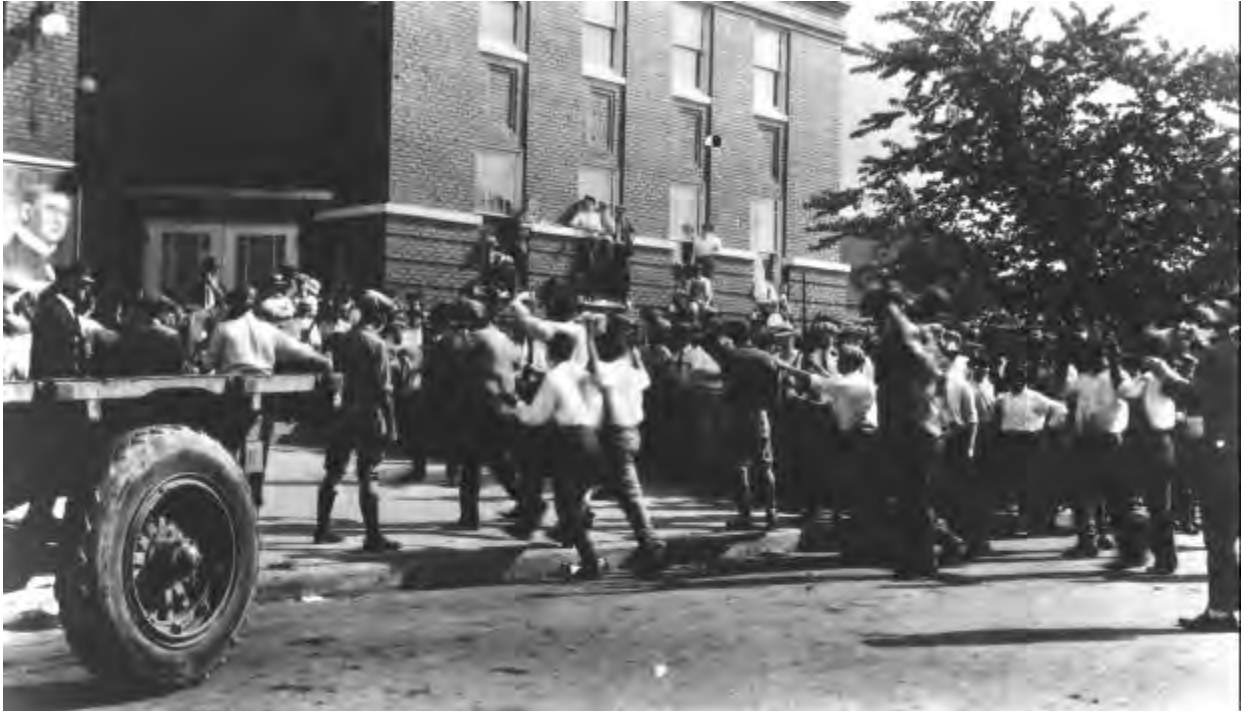
On the morning of June 1, most black Tulsans who were taken into custody were brought to Convention Hall, on Brady Street. Later, detention areas were established at the fair grounds and McNulty ball park.