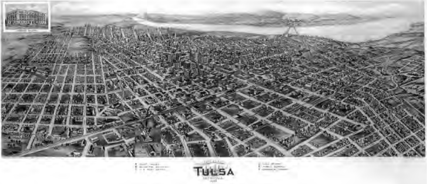
A birds eye view of Tulsa in 1918.

lier, the sleepy rural crossroads known as Tulsa, Indian Territory was suddenly catapulted into the urban age.