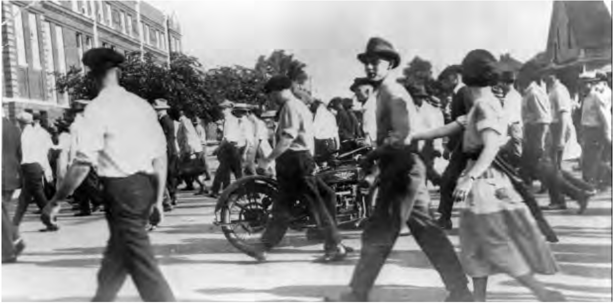
Groups of whites gathered throughout the city.

forget. He wasn't quite dead, but he was about to die. He was the first man that I saw shot in that riot." 114