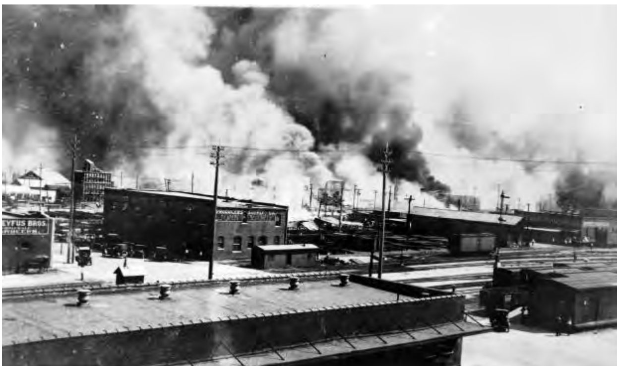
Street by street, block by block, the white invaders moved northward across Tulsa's African-American district, looting homes and setting them on fire.

throughout the night, while down along Archer Street, the fires had not yet burned themselves out. Yet, as far as anyone could determine, Dick Rowland was still safe inside the courthouse. There had been no lynching.