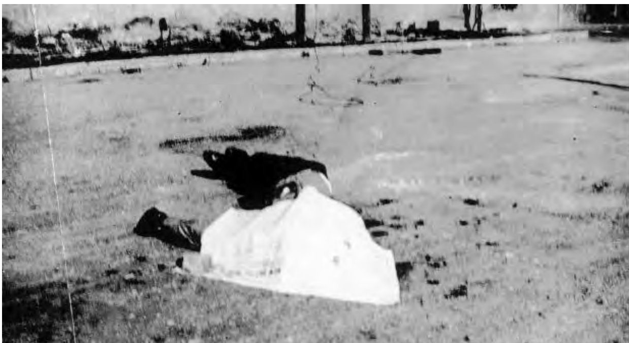
While stories have persisted for years that the bodies of riot victims were thrown into the Arkansas River, there is little evidence to support this oral tradition. Considerable oral and written evidence does exist, however, which points to African-American riot victims being buried in unmarked graves at Oaklawn Cemetery, Booker T. Washington Cemetery, and perhaps, Newblock Park.

volves cases of historical interest, such as the exhumation of President Zachary Taylor for an investigation of the cause of his death, or the recovery and identification of the remains of the last Czar of Russia and his household.