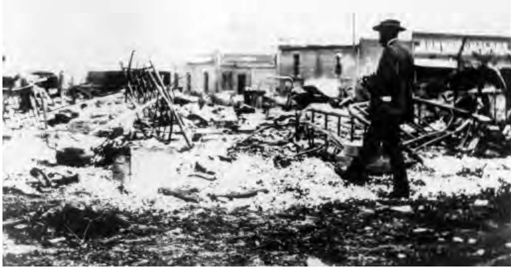
Iron bed frames were all that remained of many residences in North Tulsa.

1921-22 living in tents. Others simply left. They had had enough of Tulsa, Oklahoma.