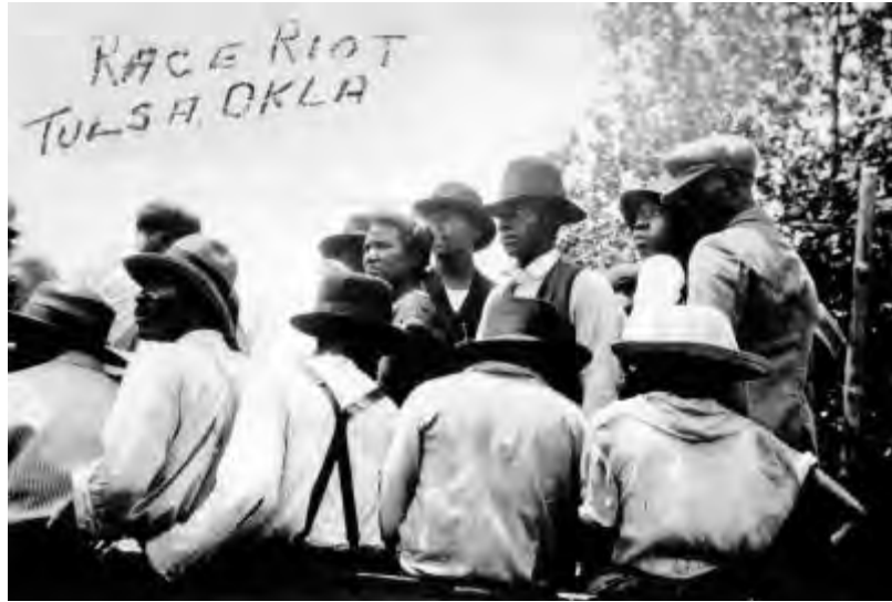
While only the author identifies a handful of white rioters, most black Tulsans soon found themselves held under guard. Even in the predominantly white neighborhoods on the city's south side, African-American domestic workers were rounded up and taken to the various internment centers.

can American district were halted, at gunpoint, by crowds of white rioters. Thereafter, what efforts that were made appear to have been directed towards keeping the flames away from nearby white neighborhoods. This may also have played a role in how another new black church, the First Baptist Church located at Archer and Jackson, was spared. "Yonder is a nigger church, why ain't they burning it?" a white woman allegedly asked on the morning of June 1. Because, she was told, "It's in a white district." 172