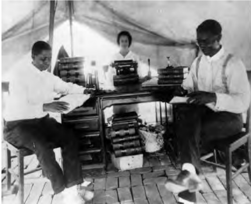
On June 7, 1921, the Tulsa City Commission passed a fire ordinance whose real purpose was to prevent black Tulsans from rebuilding the Greenwood commercial district where it had previously stood. African American attorney B. C. Franklin, shown at right, helped the legal effort that was successful in overturning the ordinance.