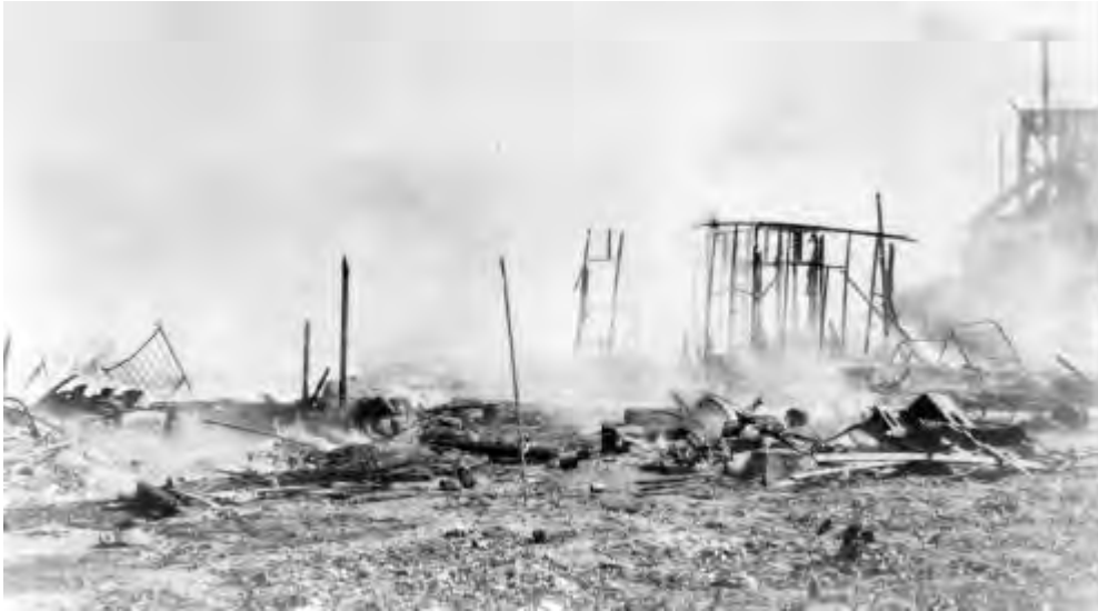
The destruction affected the African American business section and the residential neighborhoods in North Tulsa.

had surrendered to a group of whites. Shot in the stomach, he later died at the National Guard Armory. But for every riot victim's story that we know, there are others — like the “unidentified Negroes” whose burials are recorded in the now yellowed pages of old funeral home ledgers — whose names and life stories are, at least for now, still lost.