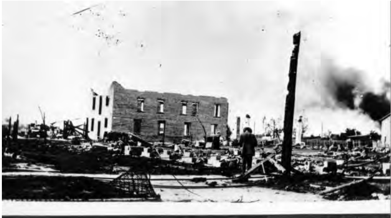
Ruins of a building completed months prior to the riot (Courtesy Oklahoma Historical Society).

Classics, a mahogany library table, a silk mohair library outfit, a Steinway piano, and Rodgers silverware, among other items. Other claims were for livestock, rental property, and other essential materials. A study of these claims reveals the diverse wealth and poverty in the community, one that could match or exceed that of many other many communities in 1921 Oklahoma.