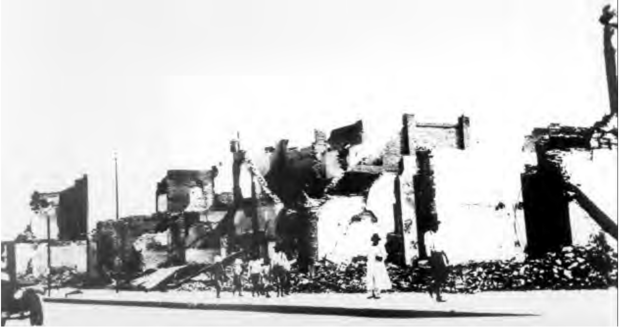
The losses in the Greenwood business district alone—including two theaters, three hotels, more than a dozen restaurants, and scores of shops, family-run businesses, and professional offices—were staggering. One contemporary observer called the deaths and destruction caused by the race riot “without parallel in America”.