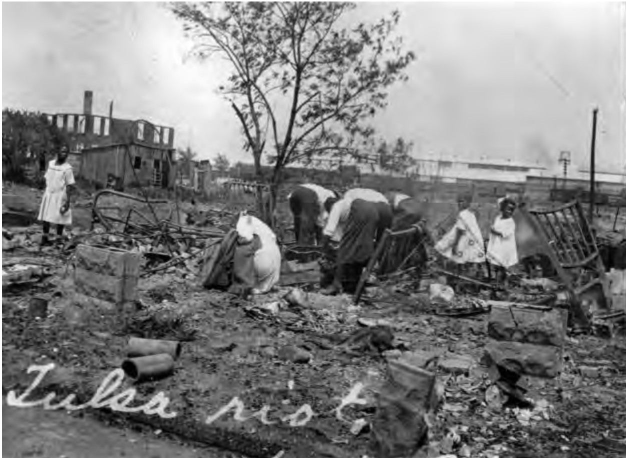
Black Tulsans salvaged what they could from their burned homes and businesses and began to rebuild on their own, using whatever materials they could find. It took some congregations years to rebuild their burned churches.

ever, many times the lot will be split and sold to two parties, making it difficult to decide who owned what part of the lot.