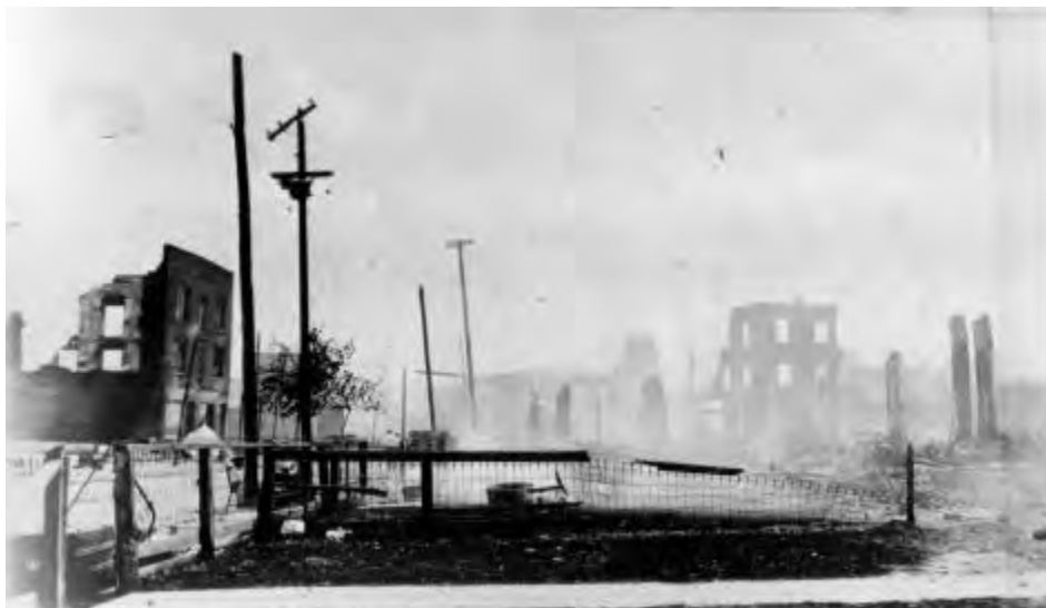
Destruction in the black business district incurred most of the financial loss of the riot.