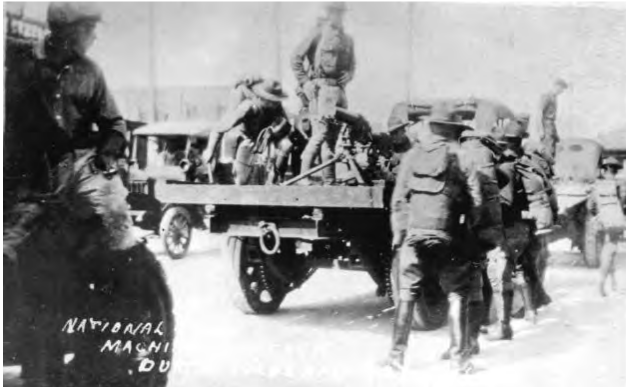
Shortly after the outbreak of violence, the Tulsa police presented the local National Guardsmen with a machine gun—only it proved to be defective. A second machine gun that was in the hands of white civilians, however, was used to considerable effect during the attack on Greenwood.