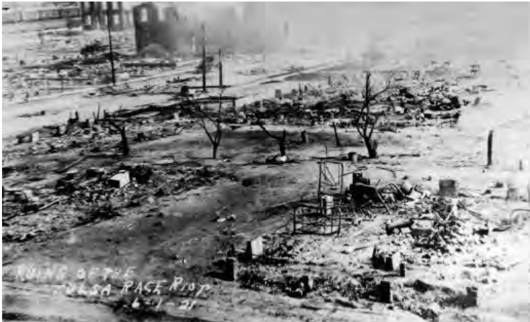
Perhaps more than anything else, what shocked most observers was the scope of the destruction in Tulsa. Practically the entire African American district, stretching for more than a mile from Archer Street to the section line, had been reduced to a waste land of burned out buildings, empty lots, and blackened trees.