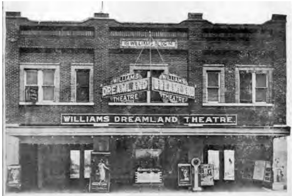
The William's Dreamland Theater before the riot, destruction after the riot, rebuilding process, and opened after the riot (All Photos Courtesy Greenwood Cultural Center).