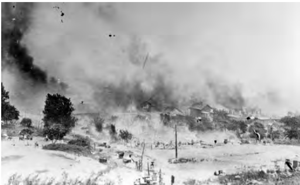
The looting and burning of African-American homes was indiscriminate, both poor and wealthy families lost their homes.

‘em.” But the crowd would not budge, and the men in the car set off alone toward Deep Greenwood. Their bodies, and the bullet-ridden Franklin, were later seen in the middle of Archer Street, near Frankfort. 143