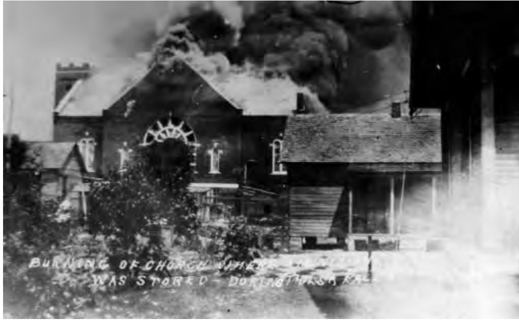
Dedicated only weeks before the riot, the Mount Zion Baptist Church was a great source of pride for many black Tulsans. But after a prolonged battle, the white rioters burned it—as well as more than a half dozen other African American churches—to the ground.

Despite the daunting odds against them, black Tulsans valiantly fought back. African American riflemen had positioned themselves in the belfry of the newly-built Mount Zion Baptist Church, whose commanding view of the area just below Standpipe Hill allowed them to temporarily stem the tide of the white invasion. When white rioters set up a machine gun—probably the same weapon that had been used earlier that morning at the grain elevator, and unleashed its deadly fire on the church belfry, the black defenders were quickly overwhelmed. As “Choc” Phillips later described what happened: