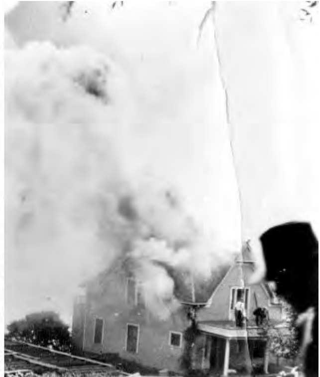
Remarkably, a handful of Tulsa's finest African-American homes were still standing when the State Troops arrived in town. But about one-hour later, a small group of white men were seen entering the houses, and setting them on fire. By the time the State Troops marched up Standpipe Hill, it was too late, the homes were gone.