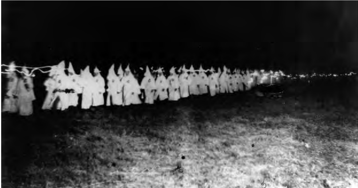
An Invisible Empire rally at Belle Isle, Oklahoma City in 1923. During the 1920s, the Ku Klux Klan flourished across Oklahoma, claiming tens of thousands members.

that he insists upon for his findings. By the most conservative of all possible methods, he can identify thirty-eight riot victims, and he provides the cause of death and the burial site for each of them. He even gives us the names of all but the four burned beyond recognition.