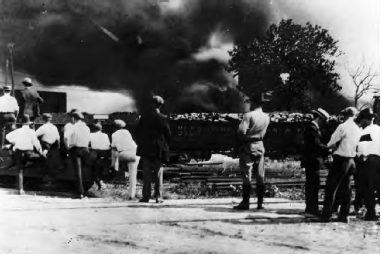
Some of the most intense fighting during the riot took place alongside the Frisco Railroad yards, as African-American defenders tried to keep the white rioters away from Greenwood. But when dawn broke on the morning of June 1, the black defenders were simply overwhelmed.

would not play an impartial role in the “maintenance of law and order.” Like many of their white neighbors, a number of the local guardsmen also came to conclude that the race riot was, in fact, a “Negro uprising,” a term used throughout their various after action reports. At least one National Guard officer went even further, using the term “enemy” in reference to African Americans. Given the tenor of the times, it is hardly surprising that Tulsa’s all-white National Guard might view black Tulsans antagonistically. As the riot continued to unfold, this also would prove to be far from irrelevant. 125