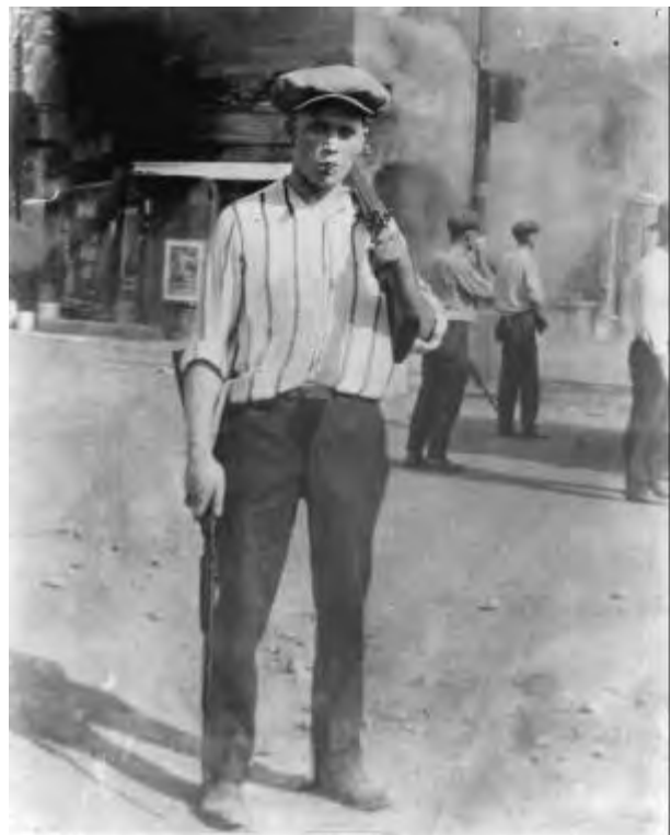
A typical member of the white mob. Not only did they set African-American homes and businesses on fire, but looted their possessions as well.

A short while later, a second, deadlier, skirmish broke out at Second and Cincinnati. No longer directly involved with the fate of Dick Rowland, the beleaguered second contingent of African American men were now fighting for their own lives. Heavily outnumbered by the whites, and suffering some casualties along the way, most were apparently able, however, to make it safely across the Frisco railroad tracks,