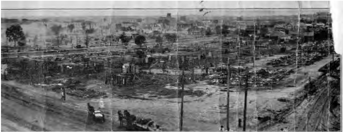
and Pipe Hill, East From Hartford and West to Boston.—Black Dispatch Publishing Co., Oklahoma City

be suspect because of their temporary involvement in the plan to relocate the black population and develop the Greenwood area for a train station. 3 The Real Estate Commission estimated personal property loss at $750,000. Between June 14, 1921, and June 6, 1922, Tulsa residents filed riot-related claims against the city for over $1.8 million dollars. The city commission disallowed most of the claims. One exception occurred when a white resident obtained compensation for guns taken from his shop. 4 The sum of the actual damage filed in the 193 retrieved court cases equaled $1,470,711.56,