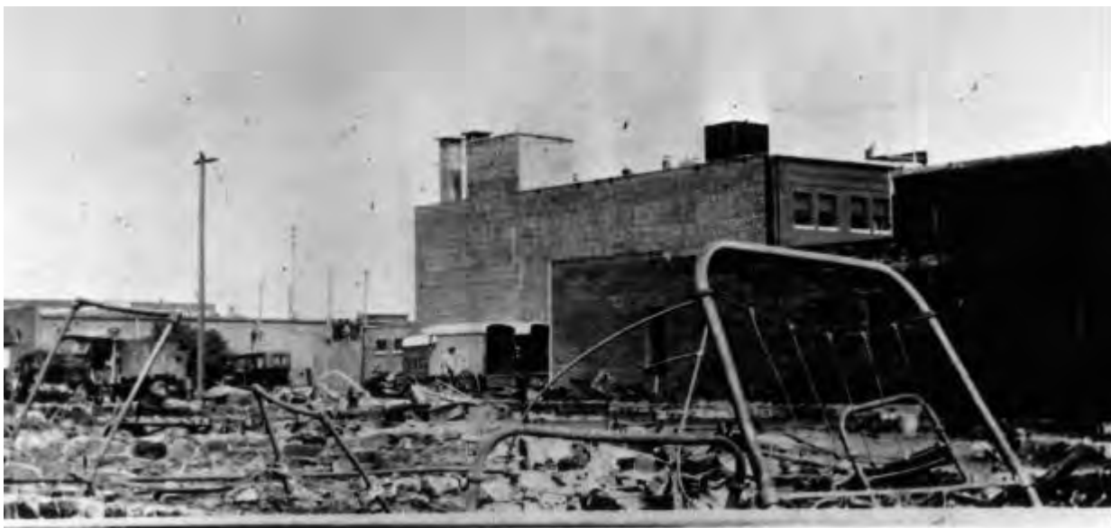
Bed frames rise out of the destruction in the Greenwood district.

What is meant by plausibility is whether the location would have functioned as a mass grave or as a means of disposing of the victims. For example, the city incinerator was reportedly used to cremate riot victims. However, according to Clyde Snow, an internationally known forensic scientist, this would not have been a feasible strategy based on what we know of the size of the incinerator and the likely number of riot victims. It would have been too time consuming and requiring too much engineering coordination. The three locations frequently cited and thought to merit further study were Newblock Park, Oaklawn Cemetery, and Booker T. Washington Cemetery.