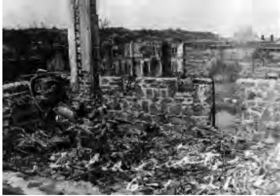
Stone and brick walls were all that were left of most of the homes in the Greenwood section.

ten-thousand Tulsans, practically the entire black community, was now homeless.