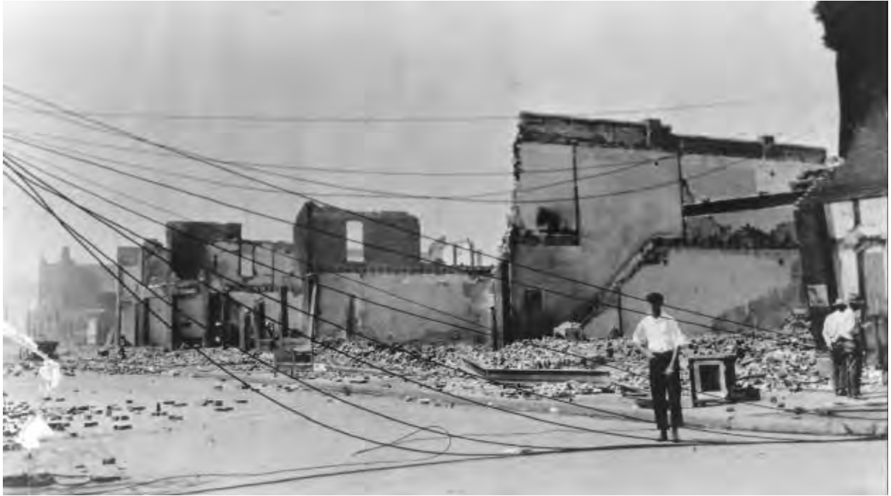
Greenwood Business District devastated by the race riot.

quired the use of fireproof material in rebuilding.