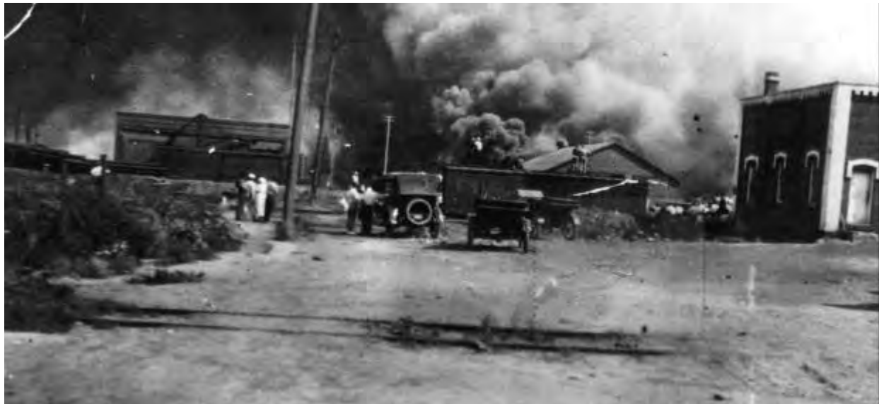
North Tulsa burns while a white audience views the destruction from a safe distance.

along Detroit Avenue were, even in the early hours of the riot, being deployed in a manner which would eventually set them in opposition to the black community. 127