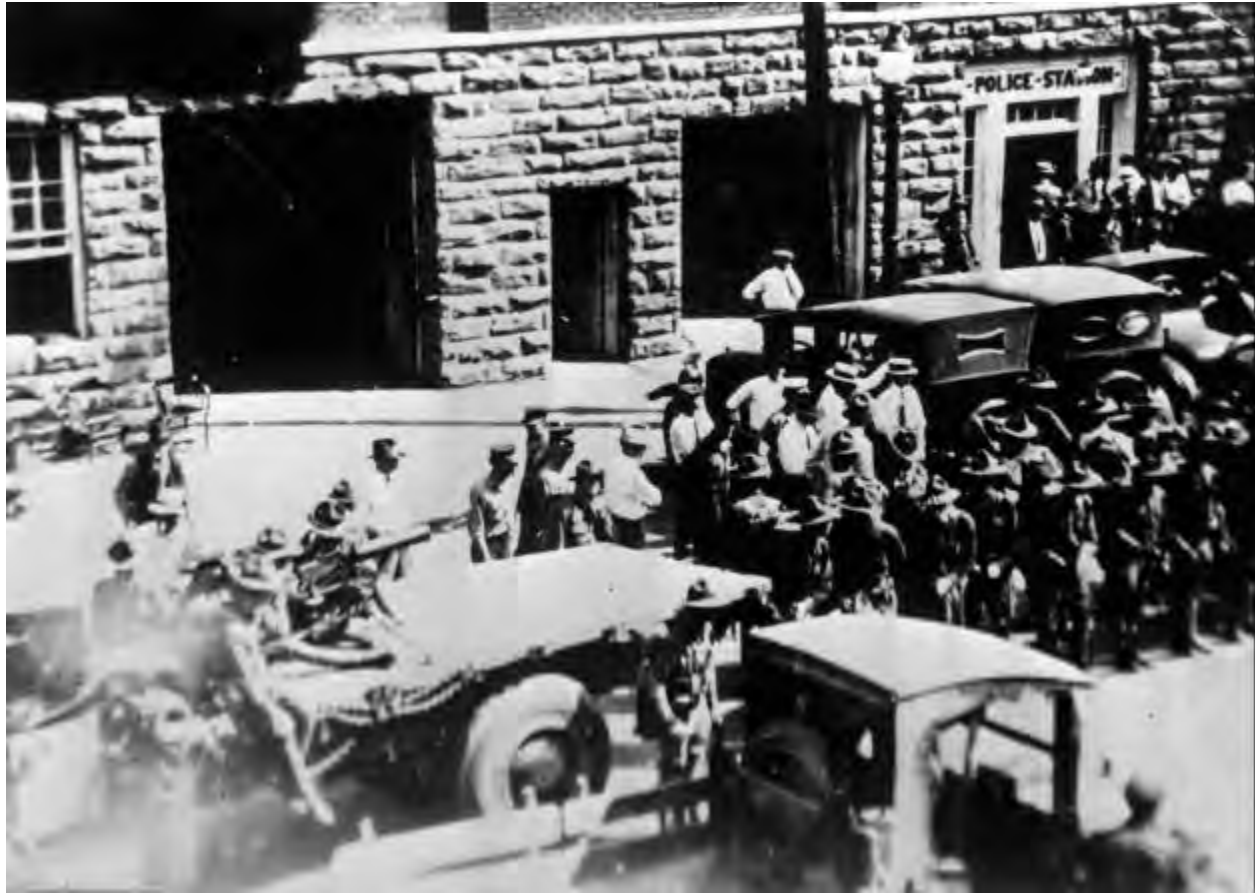
By the time the additional National Guard units from Oklahoma City arrived in Tulsa the riot had pretty much run its course. Some contemporary eyewitnesses, however, were critical of the time that it took for the State Troops to deploy outside of the downtown business district.