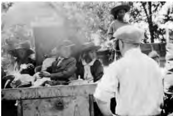
Any fleeing families were denied freedom by whites positioned on escape routes.

the north end of town. At the all-white Central High School, several male students bolted from class when gunfire was heard nearby. One of the students later recalled, “struck out for the riot area.” Along the way, he added, they were met by a white man who handed them a new rifle and a box of shells. “You can have it,” the man told them, “I’m going home and going to bed.” 181