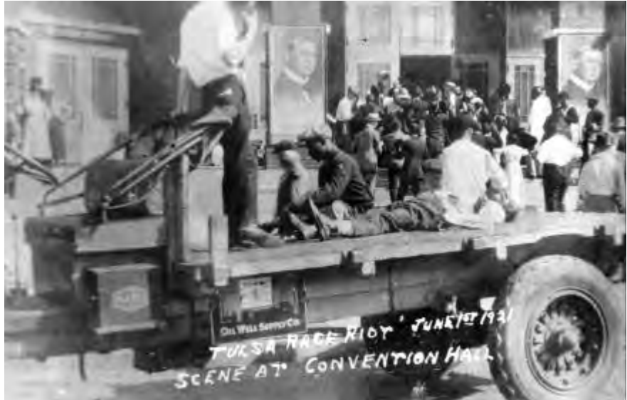
Scene in front of Convention Hall as African Americans are being incarcerated on June 1 (Courtesy Department of Special Collections, McFarlin Library, University of Tulsa).

Other written evidence, including funeral home records that had lain unseen for more than seventy-five years, would later confirm that African American riot victims were buried in unmarked graves at Oaklawn Cemetery. 199 But oral sources would also point to additional unmarked burial sites for riot victims in Tulsa County, including Newblock Park, along the Sand Springs road, and the historic Booker T. Washington Cemetery, located some twelve miles southeast of the city. 200