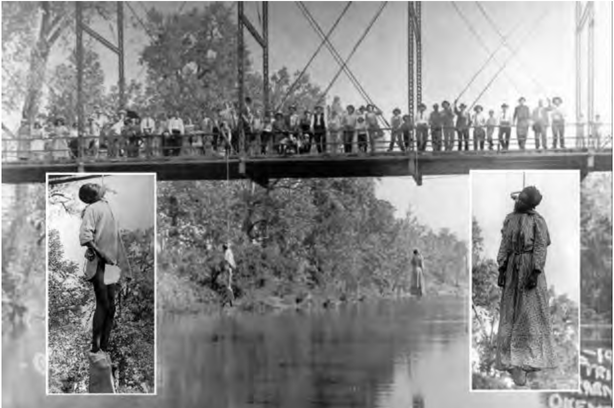
Although Oklahoma had been plagued by lynchings since the territorial days, with the coming of statehood, more and more of the victims were African American. Of the thirty-three lynchings that occurred in Oklahoma between 1907 and 1920, including this one, which occurred at Okemah, fully twenty-seven of the victims were black.