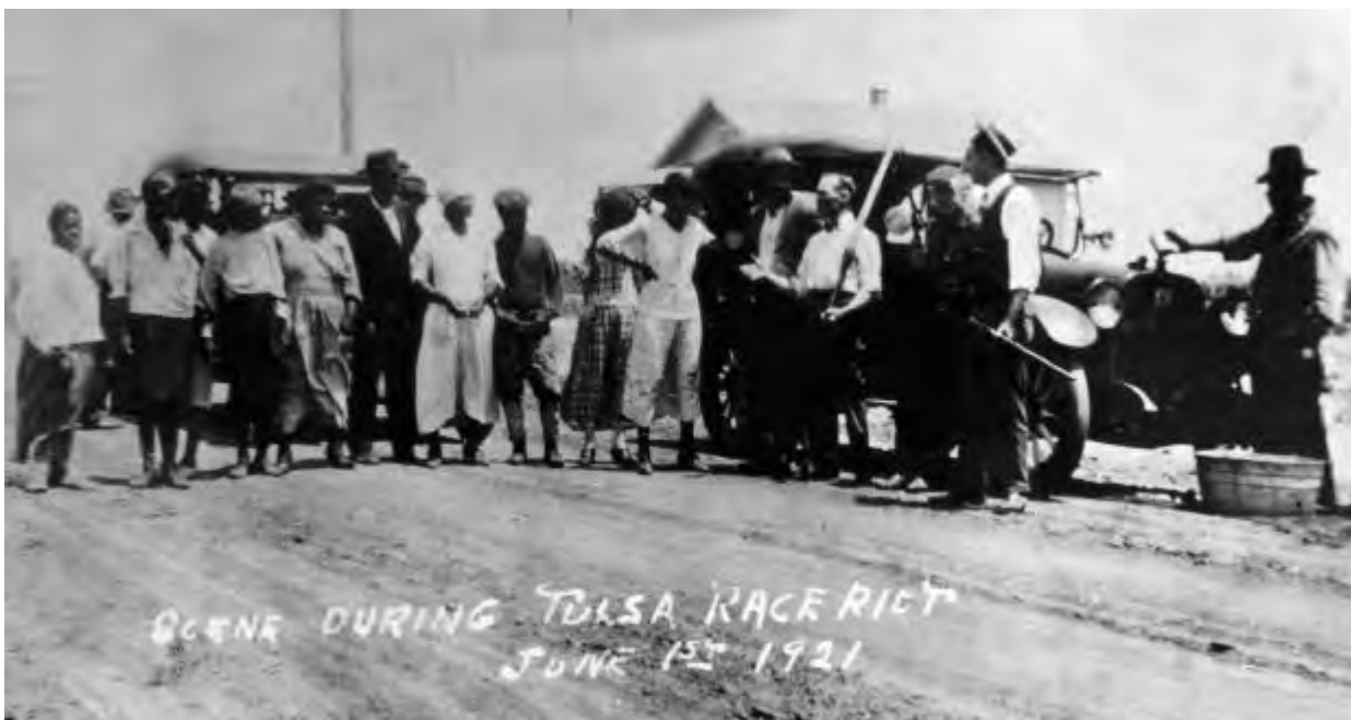
Whites detained fleeing African Americans as well as those that stayed near their homes and businesses.

No longer remotely impartial, the men of “B” Company, Third Infantry, Oklahoma National Guard, had now joined in on the assault on black Tulsa.