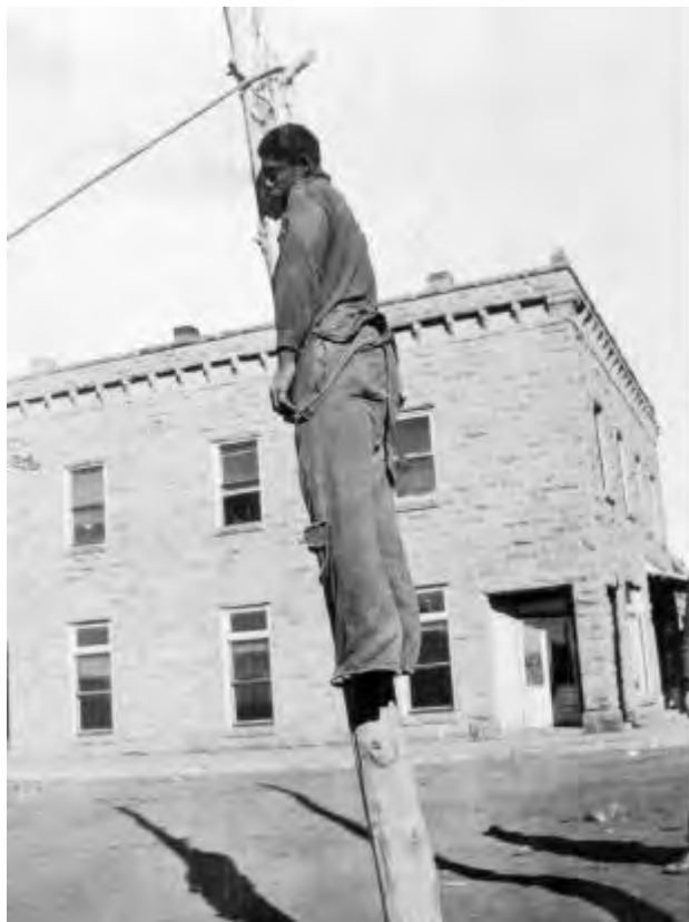
Lynching believed to be at Mannford, Oklahoma.

There is no count of how many those people numbered, but there is no need to know that. Know that there, too, something more than a bad guy had committed something more than a crime against something more than a person. Not someone made mad by lust, not a person gripped by rage, not a heartbroken party of ro-